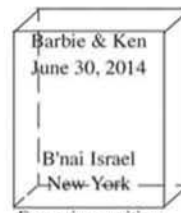
Engraving position if you select 4 lines