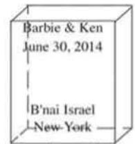
Engraving position if you select 4 lines