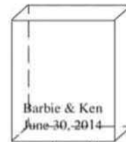
Engraving position if you select 2 lines