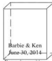
Engraving position if you select 2 lines