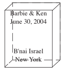
Engraving position if you select 4 lines

PLEASE NOTE: Because we sometimes receive light bulbs and glasses that have few usable shards, we will augment your submitted broken bulb or glass with additional pieces to maintain the integrity of a glass or bulb shape. Although we only add glass pieces when necessary, please check this box if you do not want us to add glass: